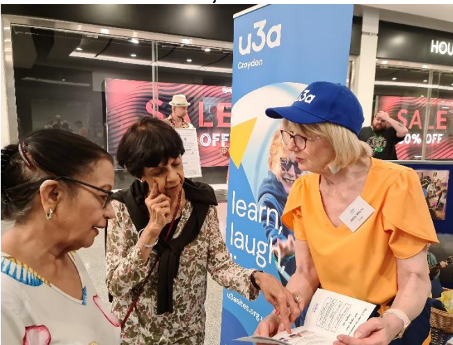
Croydon u3a at the Centrale Community Showcase event on Friday 23 June.