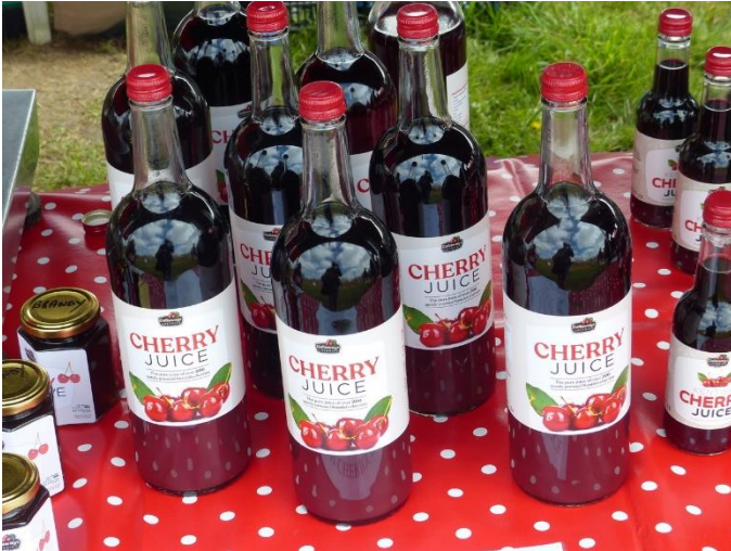
The Love Gardening group's recent visit to the Cherry farm in West Sussex where the left over cherries are turned into very special fruit juice