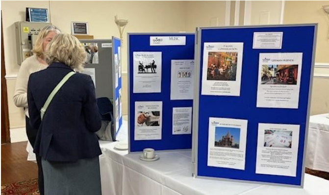
Information about our Interest Groups are on display at the Monthly Meetings

Board games fun - This group really does deliver