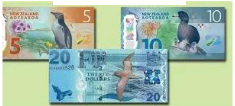
Notes from around the world