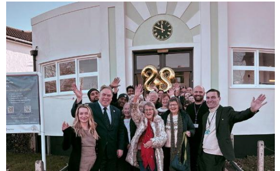
Photo: News from Crystal Palace on-line. Some of our member volunteers were at the grand opening

Please note that this is not a u3a group.